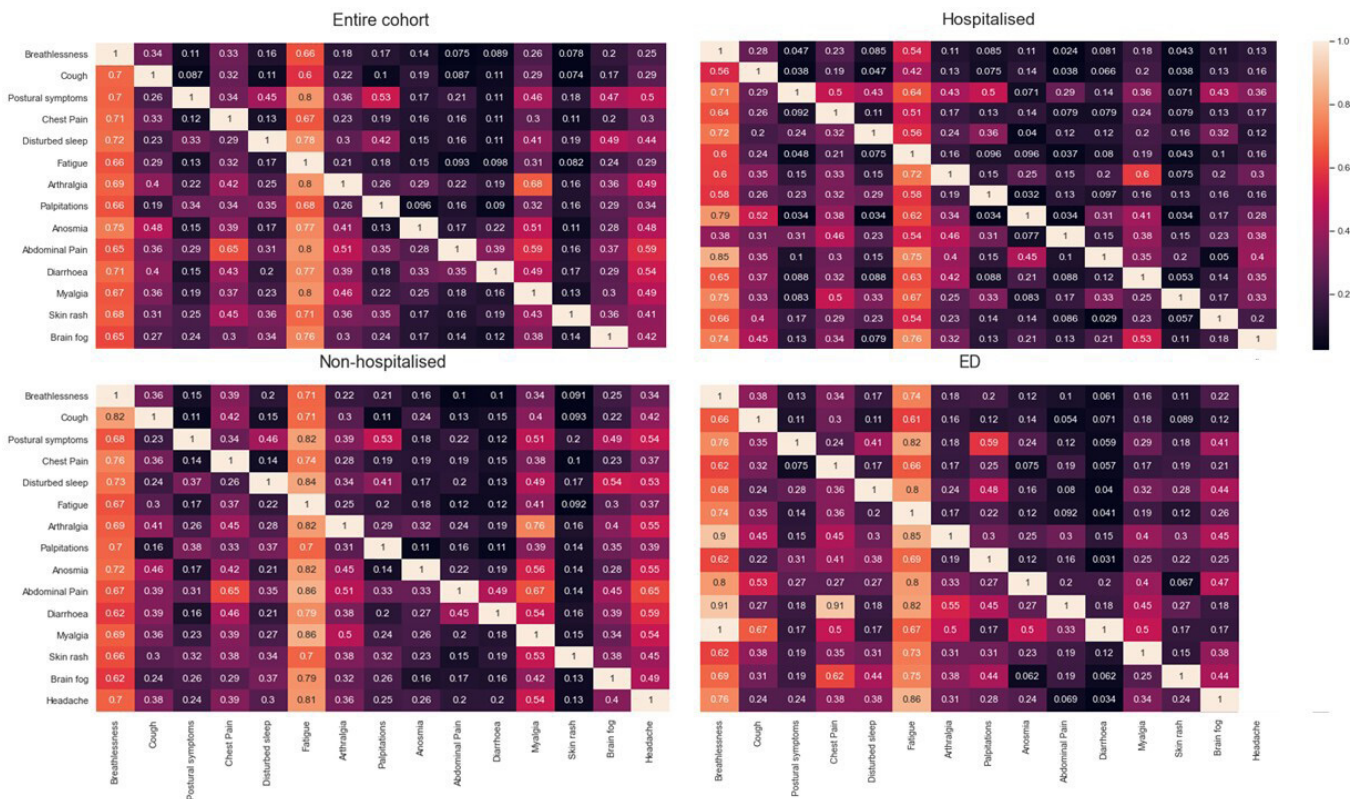
Figure 3 Co-occurrence of symptoms at first assessment of 1325 individuals referred to the post-COVID-19 assessment clinic. ED, emergency department.

in 5.8%, troponin T in 13.4%, creatine kinase in 16.9%, alanine transaminase in 18.0% and D-dimer in 18.9%. Abnormal blood investigations were more common in PH than in NH individuals (D-dimer: 28.3% vs 10.3%; troponin T: 27.0% vs 4.7%; NT-proBNP: 17.0% vs 0.0%; and eosinophil count: 6.8% vs 2.5%) (online supplemental table 2).